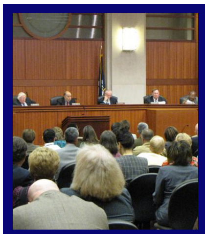
Commissioners hear comments regarding the Chapter 6 rules.