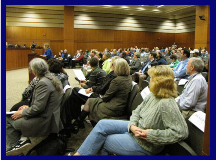
Among various and continuing opportunities for employee comment on the Chapter 6 rule changes, commissioners held an evening meeting December 8 to hear concerns.